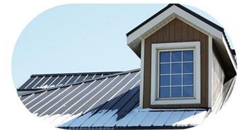
Cleaning the rooftop