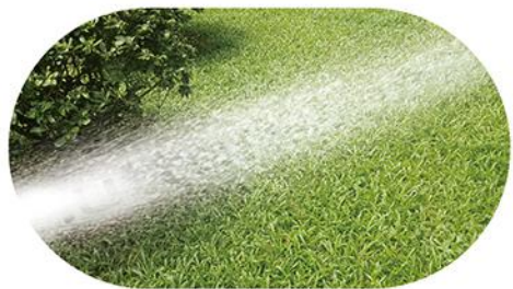
Water the lawn