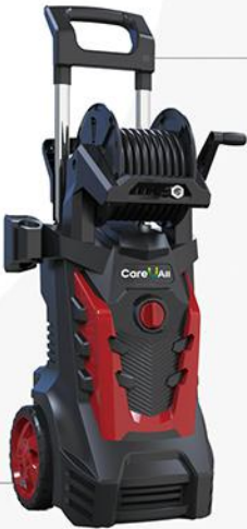
High pressure pipe easy storage wheel