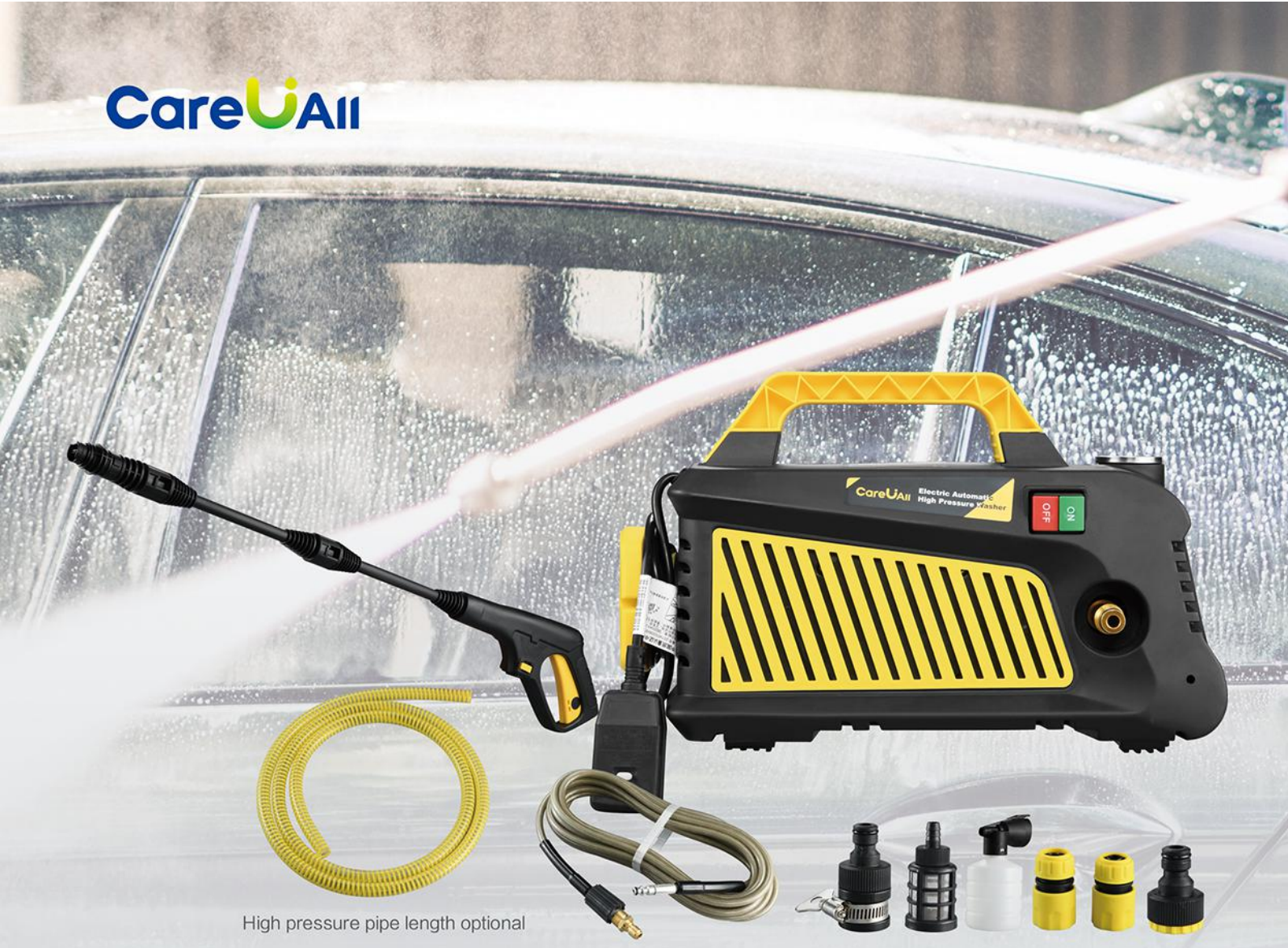
High pressure pipe length optional