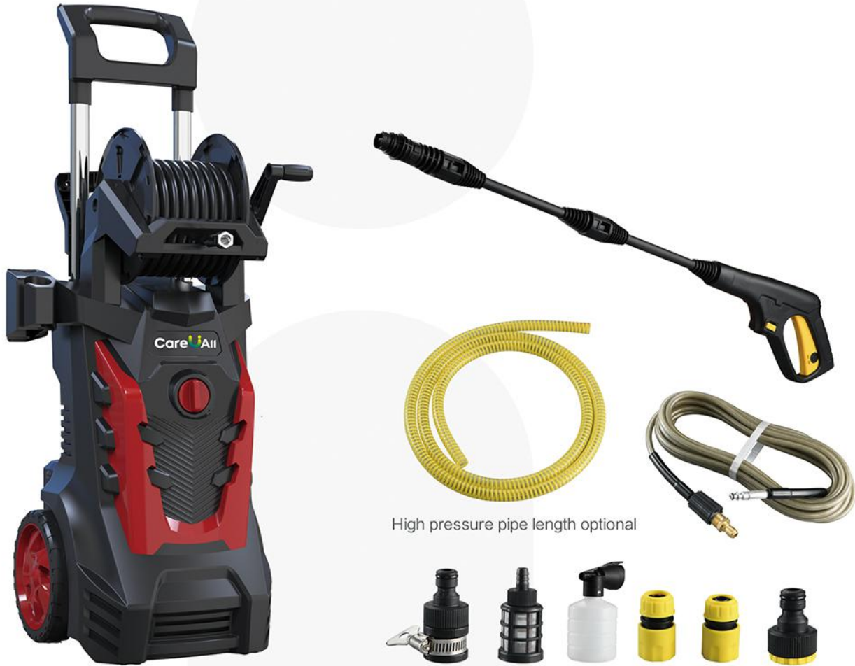
High pressure pipe length optional

Obtained EU UK CHINA certificate of design